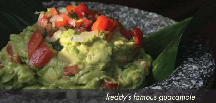
freddy's famous guacamole