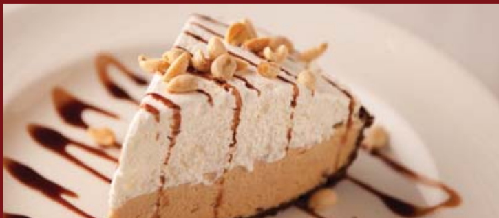
peanut butter pie