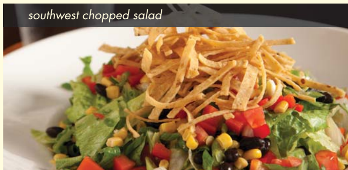
southwest chopped salad