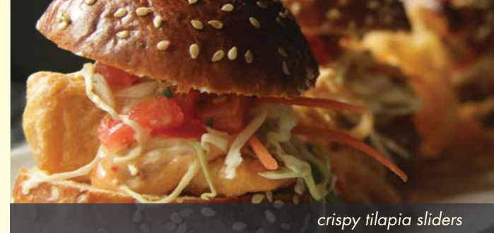
crispy tilapia sliders